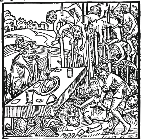
Vlad the Impaler dining in sight of his victims. German woodcut, 1499.

liche af ch:octenliche byftouien von dem wilden wütrich. Dracole wayde. Wie et die left gefpift hat. vnd geptaten, wnd mit den haußtern yn einem teffel gefoten. viñ wie er die left gefchunden hat viñ serhacten laffen alse in traut. Jtes er hat auch den mutern ire tind geptate vnd fy habes muffen felber effen. Und vitandere archioctenliche ding die in biffen Tractat gefchuben ftend. Und in welchem land er geregire hat.