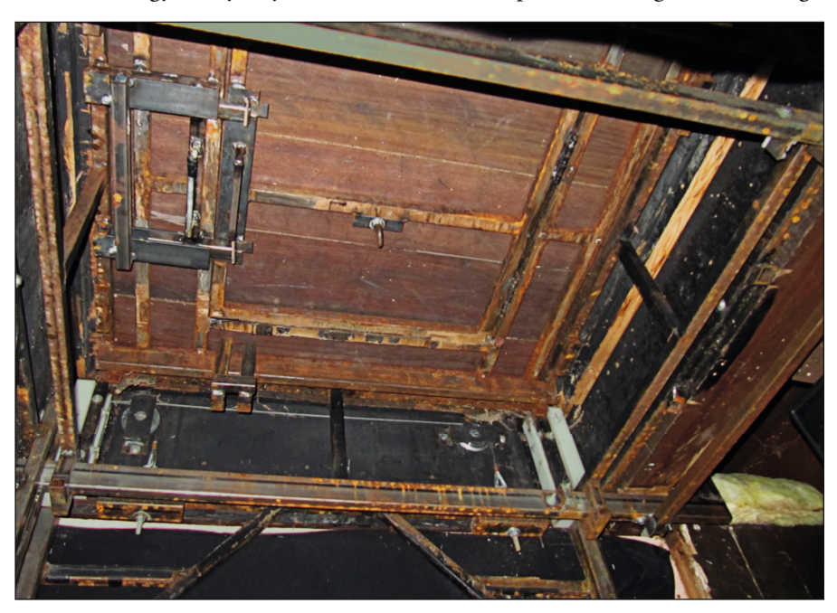
Stage trap door in the Adams Theatre, a reconstruction of the Shakespearean Globe Theatre.

information to avoid this confusion, if he had wanted to. To take Stoker serious as an author in my view means to understand this modus operandi from the dilemma he saw himself confronted with, that is, from his high ambition. Creating a mere fantasy tale was not enough for him: He wished his story to fulfil the expectations of authenticity set out in the preface. On the other hand, he did not want persons, places and dates to be clearly identifiable. Only from this paradox, the contrast of detail and vagueness, the narrative ruptures and the evident garbling can be explained. And like in the case of Castle Dracula's precise site, his methods turned out to be highly effective: His novel has shown to be a genuine "mystery story", or, to employ the idiom coined by Professor Van Helsing in Chapter 23: The plot is a perfect puddle.